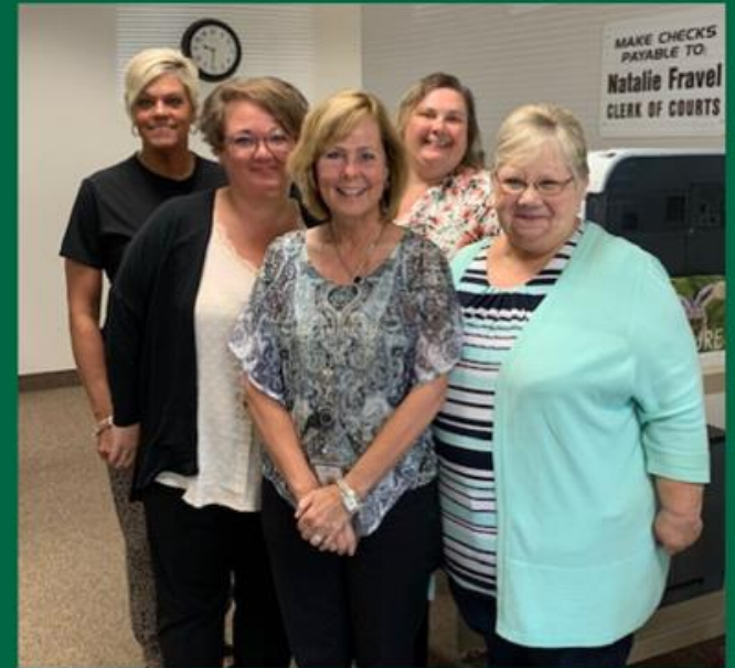
Delaware Title Office