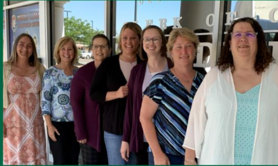
Lewis Center Title Office