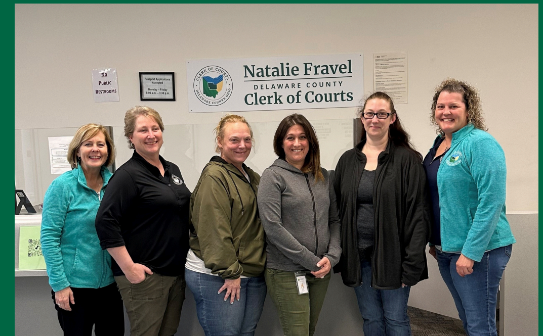
Lewis Center Title Office