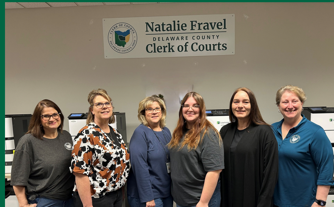
Delaware Title Office